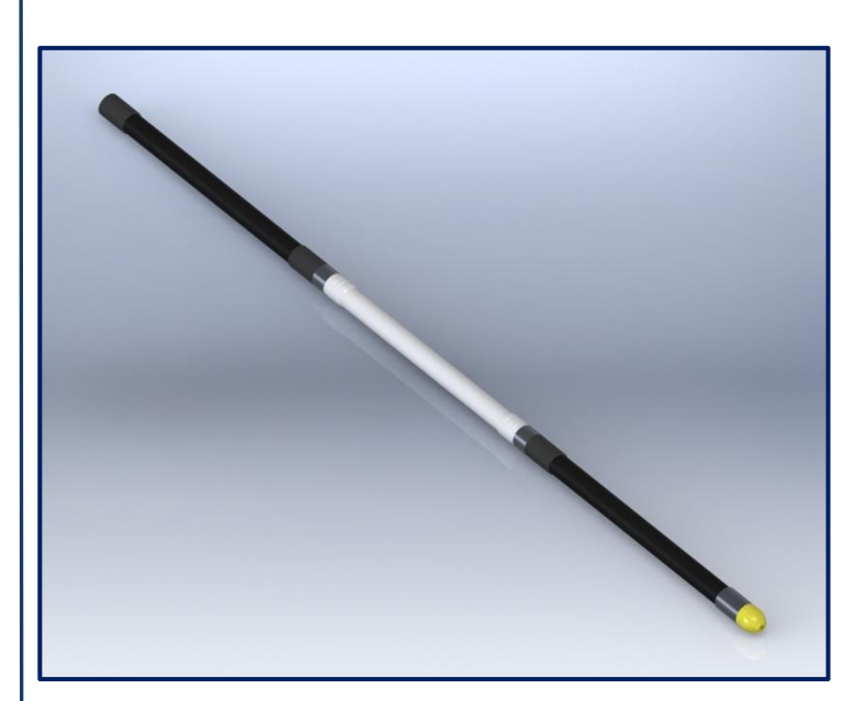
Image of the FLX-550 ST 'sidetrack' configuration, showing steel connection downhole of the composite FlexShoe.

Solution: WWT FlexShoe ST Results: Smooth, efficient casing run.