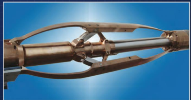
Figure 2 WWT Expandable Ramp Gripper assembly