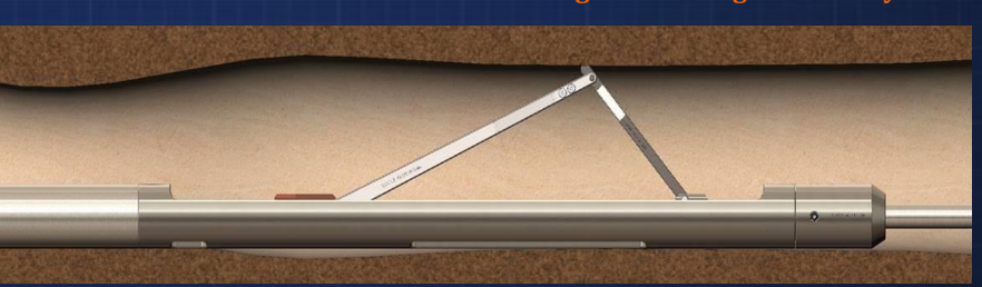
Figure 2 WWT Eccentric Link Gripper