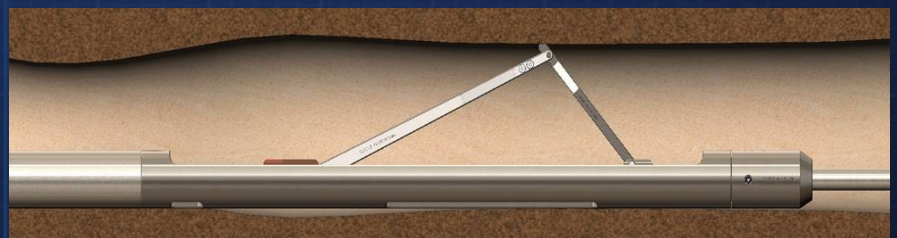
Figure 2 WWT Eccentric Link Gripper