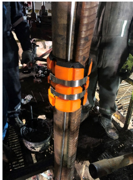
Typical WWT Slider-Clamp installed on one of the four wells.

WWT Slider-Clamp www.wwtinternational.com